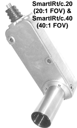
SmartIRt/c.20 (20:1 FOV) & SmartIRt/c.40 (40:1 FOV)

3.71" x 1.37" x 0.76" (94.3 x 34.9 x 19.4 mm)