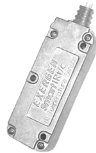
SmartIRt/c.3 (3:1 FOV) & SmartIRt/c.5 (5:1 FOV)

3.71" x 1.37" x 0.76" (94.3 x 34.9 x 19.4 mm)